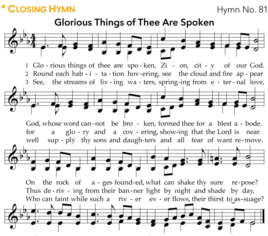
With sal - va-tion's walls sur-round-ed, thou may'st smile at all thy foes. safe they feed up - on the man-na which God gives them when they pray. Grace, so like the Lord the giv - er, nev - er fails from age to age. TEXT: John Newton, 1775, alt. MUSIC: Franz Joseph Haydn, 1797, alt.